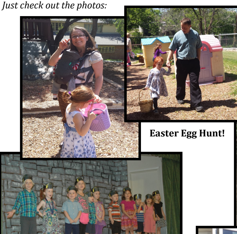
Vacation Bible School

and love of LOTS of volunteers have made for a great year!