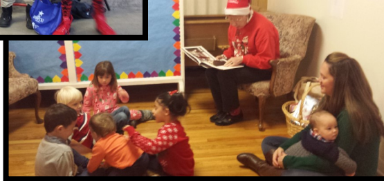
Special storytellers at Pancakes with Santa.

Our education ministry includes: 4 children's classes and 2 adult classes every Sunday (we've got great teachers!), excellent nursery care for our growing population of little ones, midweek Bible study, fellowship and service opportunities for our youth, an outstanding children's choir, the Presbyterian Parents Cooperative Preschool, weekly children's sermons in worship, Confirmation class, summer Vacation Bible School, and seasonal special events (Easter Egg Hunt, Ice Cream Social, Trunk-or-Treat, and Pancakes with Santa). All of this takes many dedicated volunteers—and for each of you, we are very grateful!