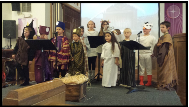
The Grace Notes Christmas pageant was perfect!