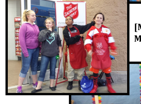
[MY]Group., our new Mid-Week Youth Group